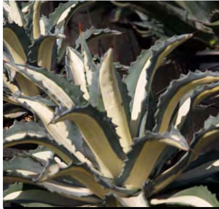
Agave americana var. medio picta 'Alba'