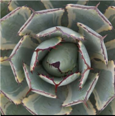
Agave 'Kissho Kan'

There are hundreds of members belonging to the Genus Agave, many indigenous to Mexico, with a smattering native to the American Southwest, Venezuela and Central America. Agaves are great as accents paired with succulent groundcovers, as structural elements in the mixed border, and as powerful focal points in pots. Many of the most imposing and desirable are ferociously armed with serrated teeth and sword-like spikes so place those varieties carefully. Soft bodied (unarmed) and variegated types can be placed in the landscape with less caution but tend to do best with some shade inland during the hottest part of the day. Most Agaves are offsetting and will sometimes slowly, sometimes quickly, create colonies. Flowering only after many decades, mature Agaves produce huge, startling flower spikes that look like something out of a Dr. Seuss book. Agaves are easy to grow, especially in Mediterranean and Southwest climates, drought tolerant and so architecturally and geometrically desirable that their very few anti-social qualities are easily overlooked.