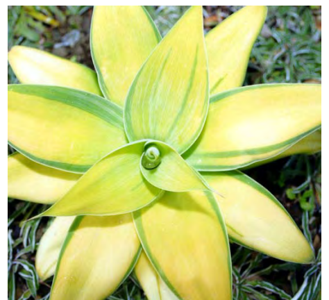
Agave attenuata 'Kara's Stripes' PP 19,444