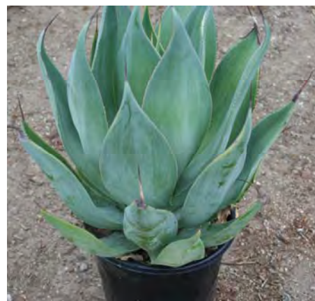
Agave 'Blue Flame'