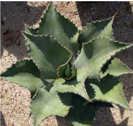
Agave 'Mr. Ripple'